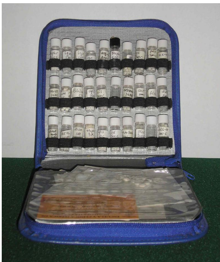
Figure 6. Large remedy kit

Also note whether the patient felt more energetic, more in harmony with himself/herself, whether symptoms moved downwards in the body, or from the inside of the body outwards. These are typical indicators of a curative remedy.