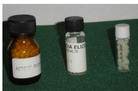
Figure 3. Three remedy flasks

Understanding this subject is very important as you may need to make your own remedies in cases of emergency, such as flu during epidemics, when a remedy is unavailable, or after natural catastrophes. Homeopathic remedies are made from solid (e.g. gold, sea salt, sand), liquid (e.g. plant juices, snake poison, milk), and ethereal (e.g. magnetic fields, moonlight, the colour blue) substances. We will deal with liquids first.