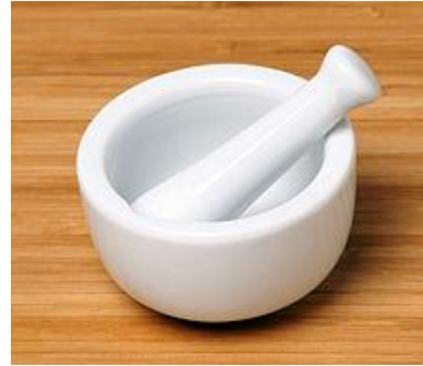
Figure 4. Mortar and pestle.

Now you have a powder which contains 1/100^{\text{th}} of a grain (60 mg) of uniformly potentised sea salt, i.e. the potency of 1C. Continue as follows: