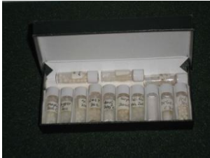
Figure 1. Carton remedy kit

Start by putting together your own personal starter kit as given in Appendix C . You will need to find a remedy supplier and a small box with vials, such as the one in the figure, that can contain the ten remedies of the kit.